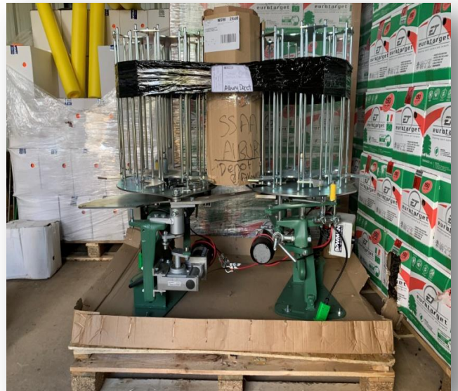
Bowman Supermatch Sporter x 2