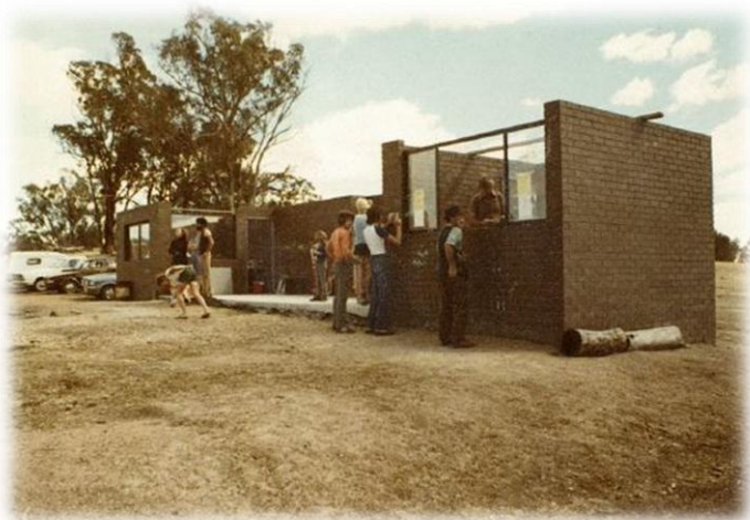
The Clubhouse being built.