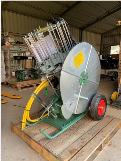
Bowman Supermatch Chondel/Teal