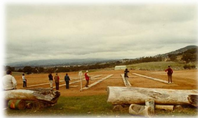
"What a view"