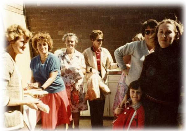
Ladies helping in the kitchen