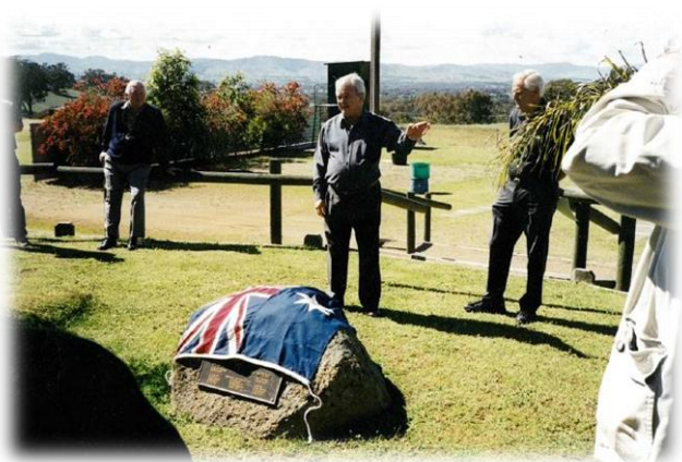
Official Opening of AWCTC